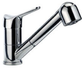
Mixer Tap S1000 - Z65 8449 500